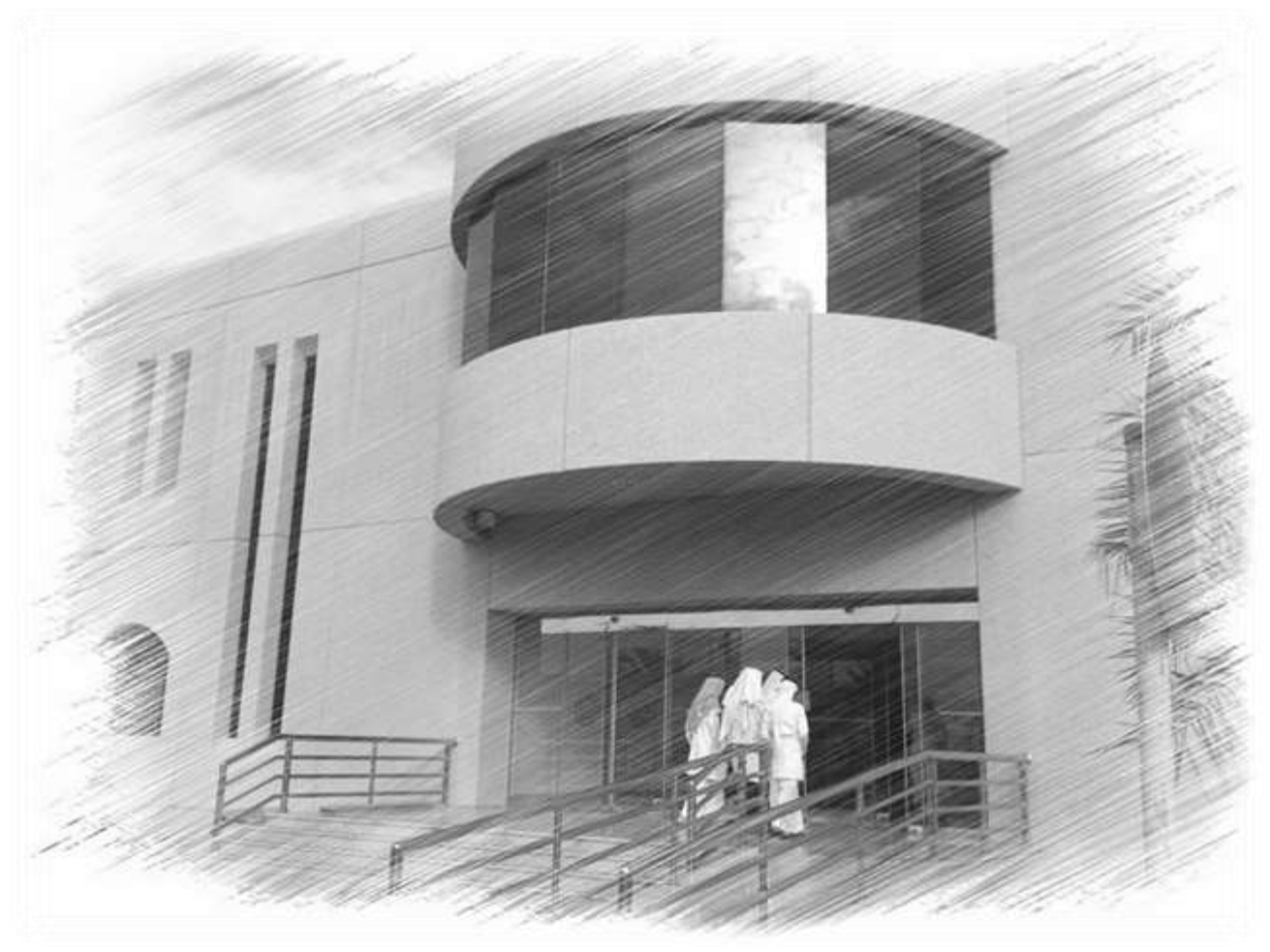
AFFILIATE HOSPITAL PROFILES