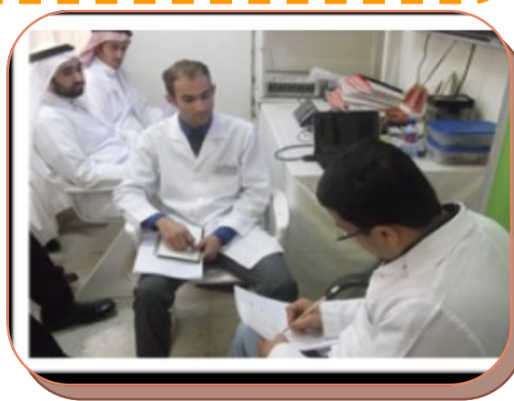
Picture of Departmental activities showing students involved in teaching and training at Primary Health Care Centre.