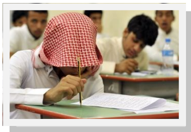
showing some students